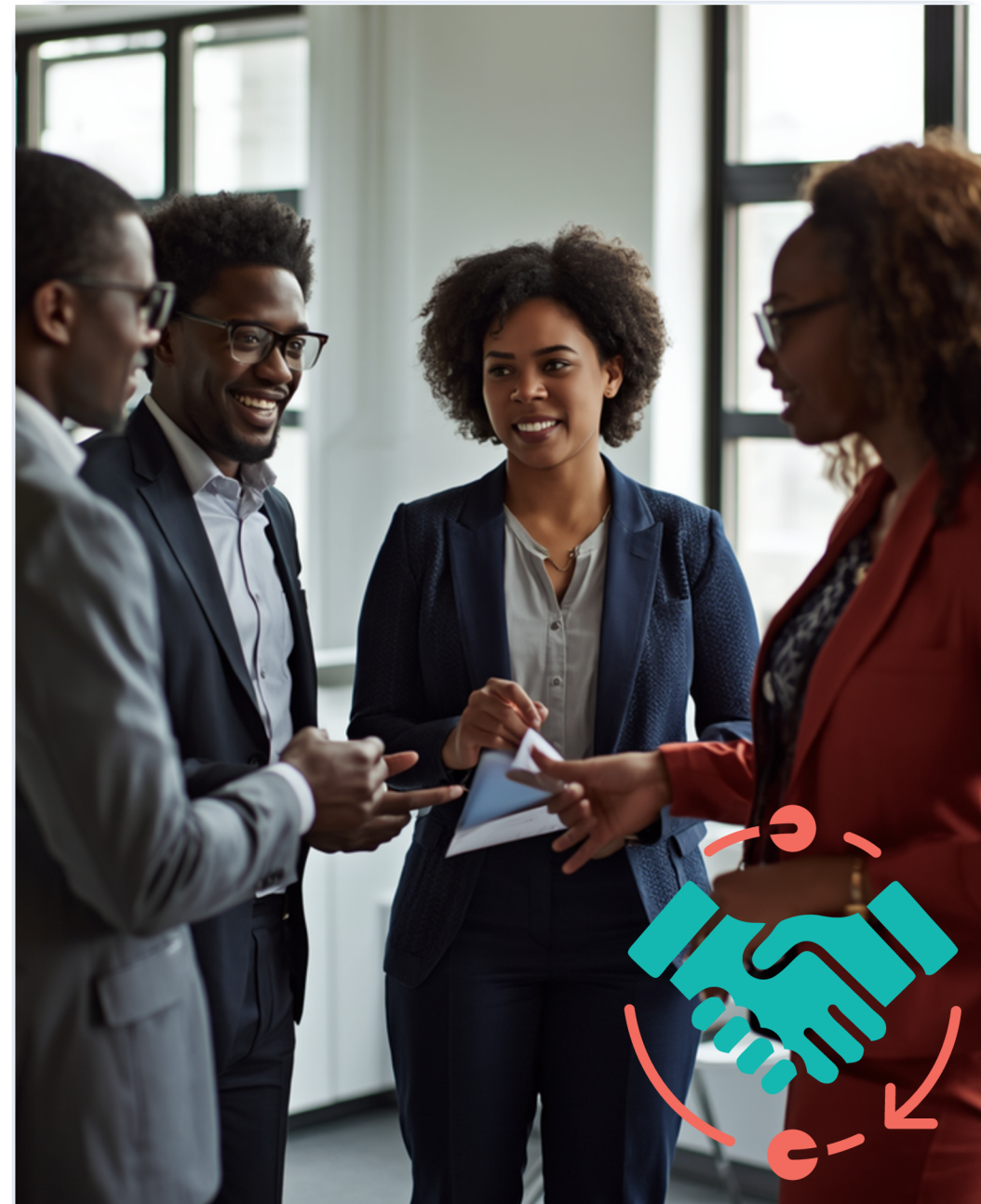
Networking & Job Opportunity