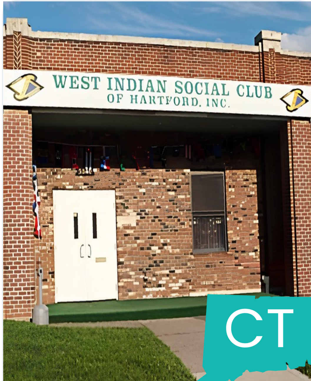
LITTLE CARIBBEAN MAIN STREET Hartford, CT