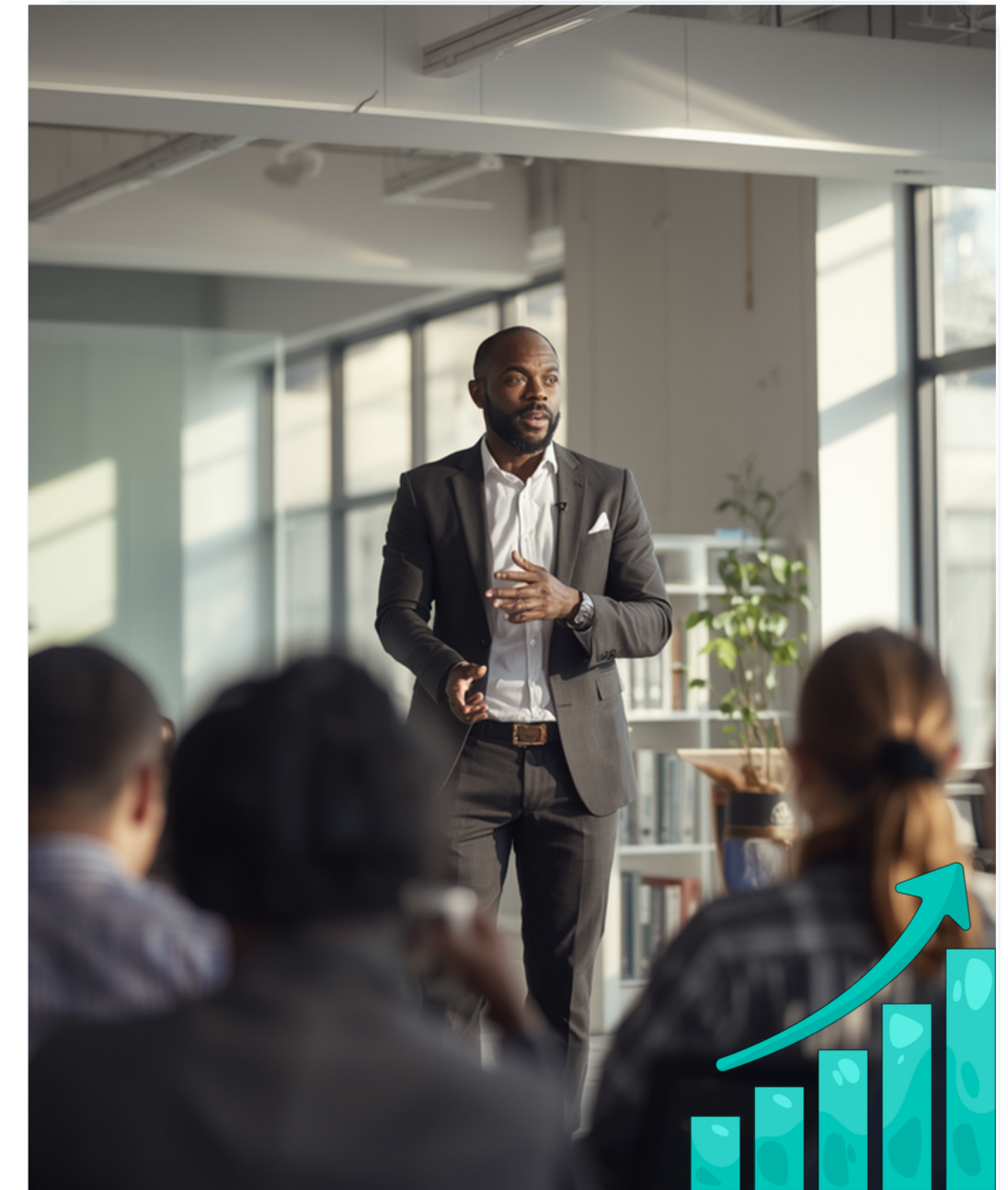
Presentations / Workshops